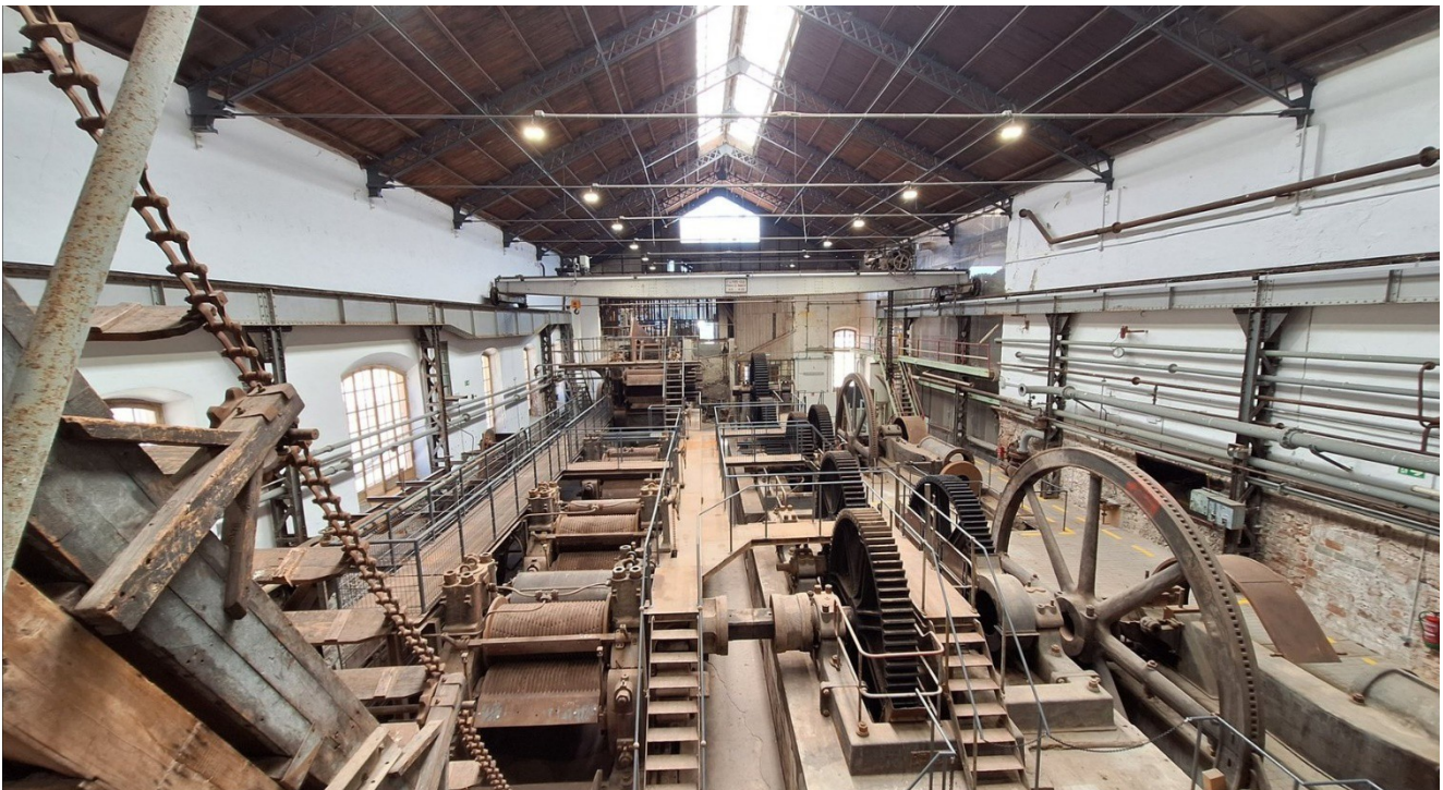
Azucarera El Pilar, mill train shed, Motril (Granada)

On this occasion we invite you to revisit the industrial heritage from the perspective of movable property