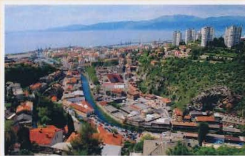
Rijeka, Croatia, the Torpedo history and heritage conference venue.