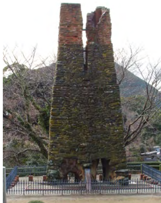
The reverberatory furnace at Hagi

Further details of the application are shown separately in the article from Professor Akira Oita.