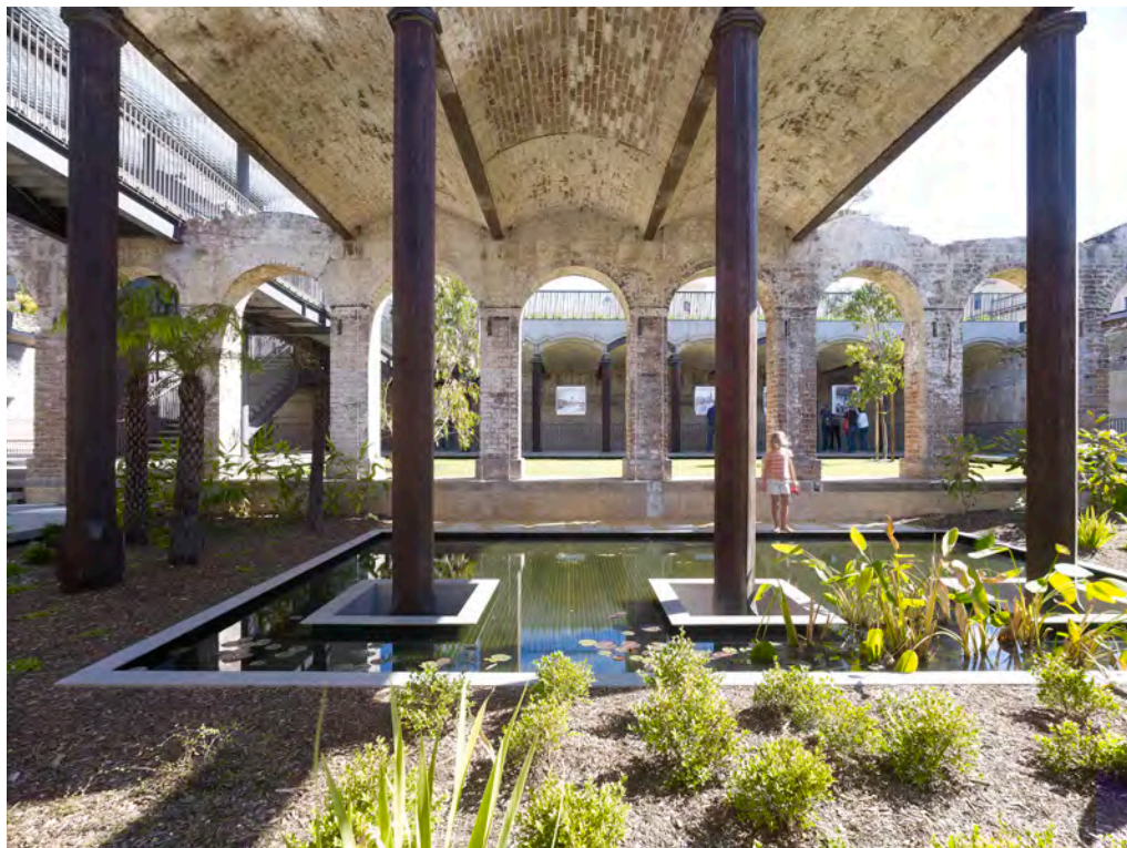
Paddington Reservoir Gardens is a striking new urban park that makes a ruined former reservoir available for the public to enjoy and explore. Among the other case studies are a former tyre factory and an Easter Egg factory.

The issues paper and case studies are available at http://www.dpcd.vic.gov.au/heritage/projects-and-programs . Videos of the symposium will be online soon.