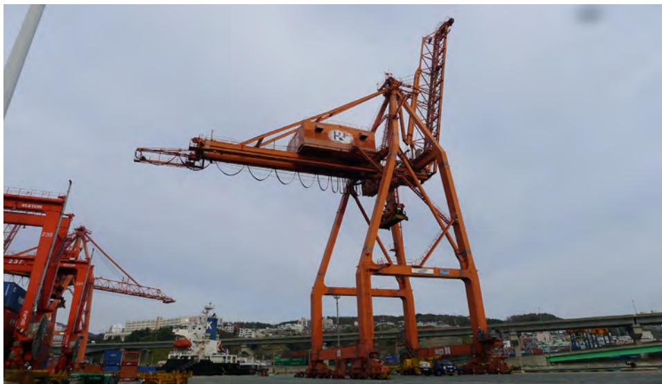
The first South Korean-made container crane(Samsung Heavy Industries) in the immense Bukhang docks

Bukhang embodies a sense of identity for Busan as Korea's first maritime gateway. The port also offers an outstanding scenic beauty through constant repeating patterns from the facilities (columns for doors, gates, cranes, warehouses, etc.) that are distributed throughout. In particular, the silos in Yanggok Pier has an excellent landmark value, and the spatial patterns of the unloading area connected to the container docks, the sites of support facilities and the movement lines of various handling equipment and personnel are considered to be unusual sceneries.