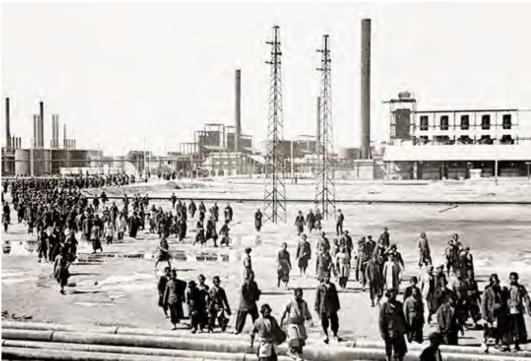
Abadan Oil Refinery

The first railway in Iran, established in the Qajar period, was a horse-driven suburban line connecting Tehran to an important religious place in the south of the city. It was later converted to steam. But the most important railway construction program was from 1925 to 1937. This connected Bandar Torkman on the Caspian Sea in the north to Bandar Shahpour on the Persian Gulf in the south of Iran. To finance this project the government made a new tax on sugar and tea products and also borrowed from two Iranian banks.