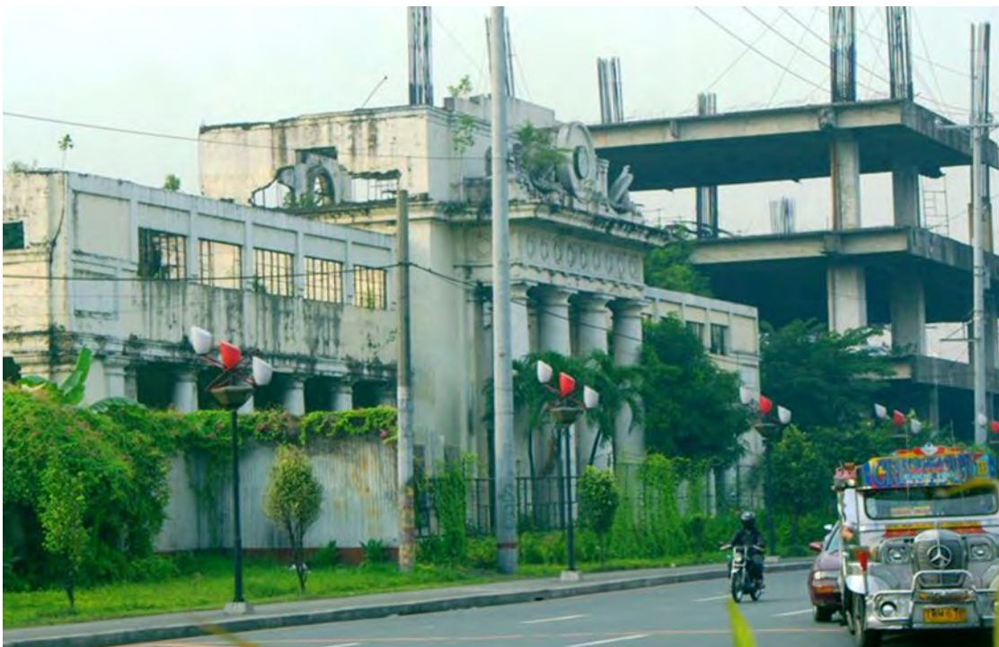
Now in a pitiful state, the Paco railroad station in Manila was inaugurated in 1908. Designed by American architect William E. Parsons, the style is supposed to mimic that of the grand Pennsylvania station in New York. The National Historical Commission, PNR and other governing bodies decided to restore the structure in celebration of the station's centennial, with the addition of a historical marker on the structure in 2009. Yet until now we await the realization of this project.

During the 1935 Commonwealth government, natural disasters through both a series of raging typhoons and record droughts in central Luzon affected the production of sugar, rice and tobacco. In addition there were labor union problems to be addressed along with a decrease in mass purchasing power. Construction of highways and roads to the rural areas and the unstoppable advancement of new motor vehicles, trucks and buses competed with the steam-engine trains, especially for short-haul services, aggravated the downside of railroad revenues.