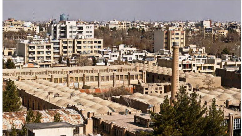
Risbaf textile factory, surrounded by new construction Isfahan, Iran

The knowledge of bridge constructing was an important skill in Iran from ancient eras, before and during the Persian empires and also in the Islamic periods. Influenced by the industrial developments, new bridges had started to be constructed along important routes and railways. Many of them have been built in the difficult terrains with the limited facilities. One of the most famous bridges of this era is Veresk Bridge which was constructed in 1936 by an Austrian engineer.