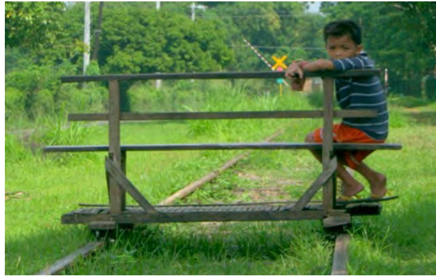
An inactive portion of railroad in Calamba, Laguna, south of Manila. Most Filipinos living along the railways (informal settlers) have improvised their own cart, transporting people short distances. This cart is an improvisation. The operator is a little 12-year old boy who earns 20 pesos (about half US dollar) for every trip for those in a hurry to get to the nearest village.

There is a need to recognize and revive old railways of Luzon as opportunities for new industries perhaps by branching out newer railway tracks that could link to well-planned residential-commercial or business-industrial developments. Industrial heritage, quite unfamiliar to the new generation of Filipinos, should be part of considerations set for future regional and urban planning by experts in the field and foresighted government decision-makers. Apart from uncontrollable forces of nature, destruction of wars and perhaps time itself may have physically erased the railway lines prepared and supervised by Spanish engineers, constructed and operated by the British, then the Americans, but the legacy of the railway industry will remain indelible in all important aspects of Philippine history.