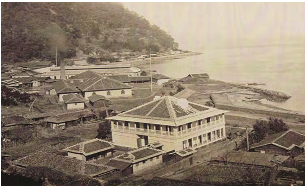
In Kagoshima the Satsuma clan set up Japan's first modern steam-powered textile mill in 1867, within months of the rapprochement with the British Navy following its bombardment of the city. Nearby stands Foreigners' Residence, where the team of Lancashire engineers lived while they set up the mill. This pioneer factory complex, with its origins in the 1850s, embraced a blast furnace, reverberatory iron smelter; shipbuilding, iron and cannon manufacture, textiles, glassware, food, publishing and chemical products. Firebricks were produced for the smelters, and fine pottery and glassware was made to help generate income to capitalise industrial development. Some 1,200 people were working at Shuseikan at its peak. These pioneering innovations in Kagoshima formed the basis for other textile industry developments elsewhere in Japan, most notably in Osaka. Shuseikan also introduced the Factory System to Japan.

Photograph: The Pioneer factory complex at Shuseikan, next to the Shimadzu summer garden, Kagoshima, 1872