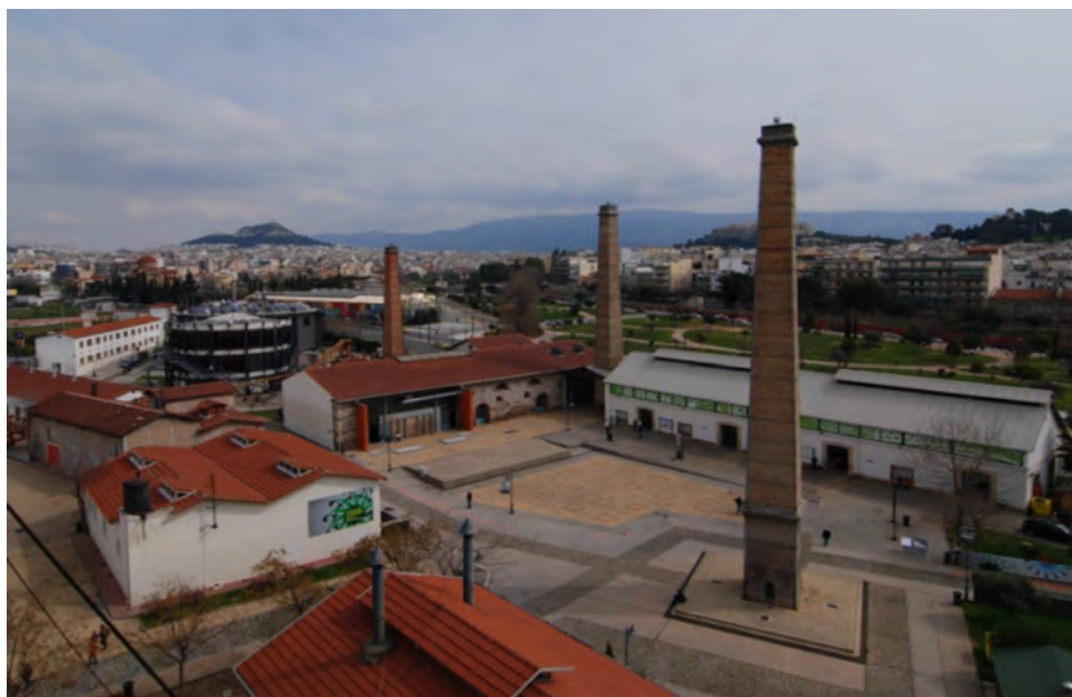
A general view over the Athens gasworks museum

In 1937 the Athens Municipality took over the gasworks and thus the presence of Europeans in the factory's administration came to an end. In 1952 the number of consumers dropped dramatically mainly due to the advent and popularity of electricity.