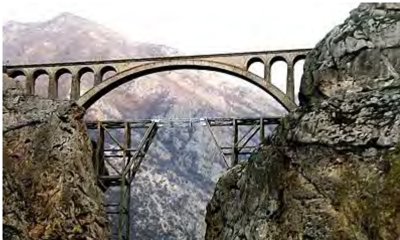
Veresk Bridge on the Trans-Iranian Railway

Having an important role in World War II, Veresk Bridge was known as the bridge of victory and serves the Trans-Iranian Railway network in northern Iran. It was registered on the national heritage list in 1977. Another famous bridge of this era is the White Bridge in Ahwaz City in the south of Iran.