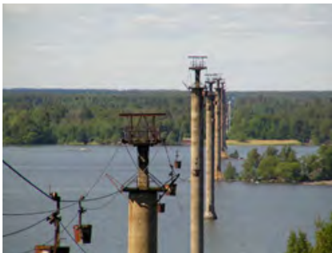
A section of the Forsby-Köping limestone cable way.

The most important explanatory factor, however, is the changing climate for industrial heritage preservation in Sweden in recent years. At a conference in October 2012, professionals and researchers within the field in Sweden all gave witness to a trend in which industrial heritage preservation is not a priority anymore. The fall of the cable way is a sad but very clear example of that trend. It will be an important task for TICCIH as well as the larger community in the field of industrial heritage to reverse that tide.