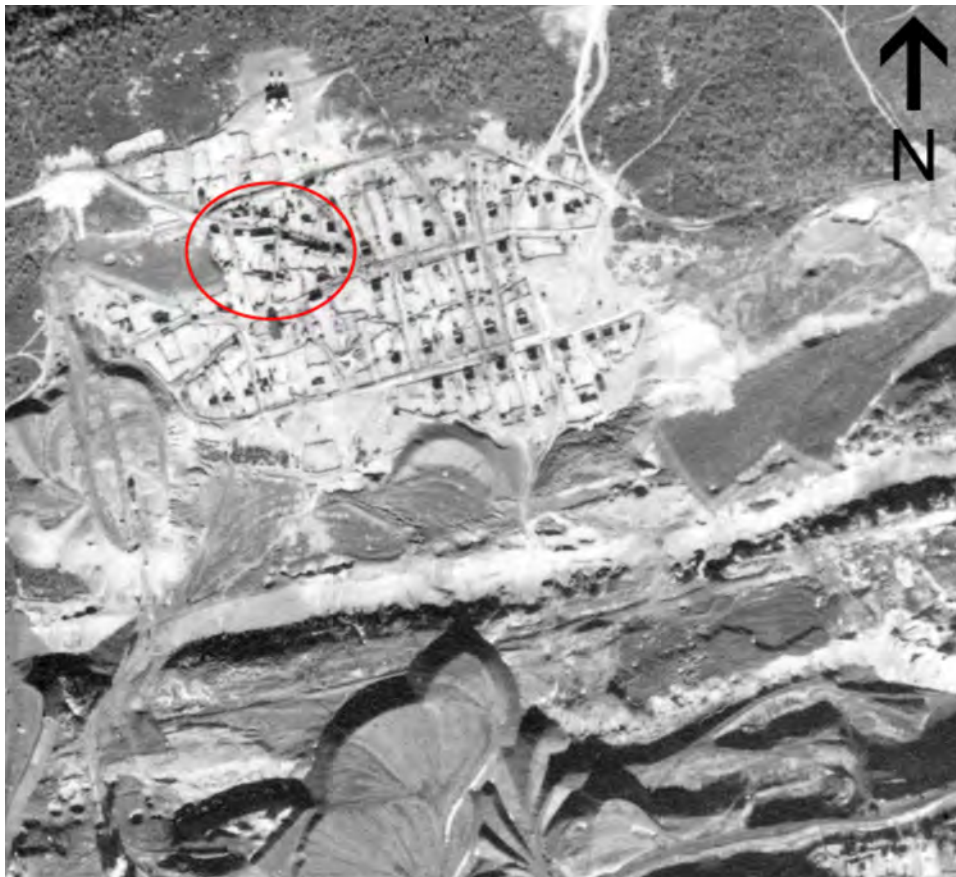
A 1938 aerial view of Pardeesville showing Italian shanty enclave (circled in red) and company-built double houses. Stripping operations can be seen immediately to the south of the town.