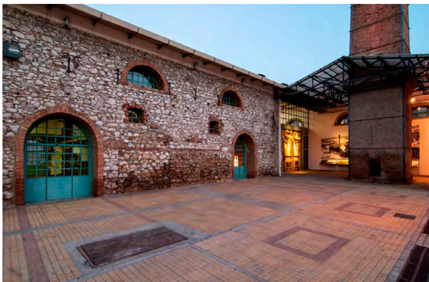
A panoramic view in the old retorts built in 1862