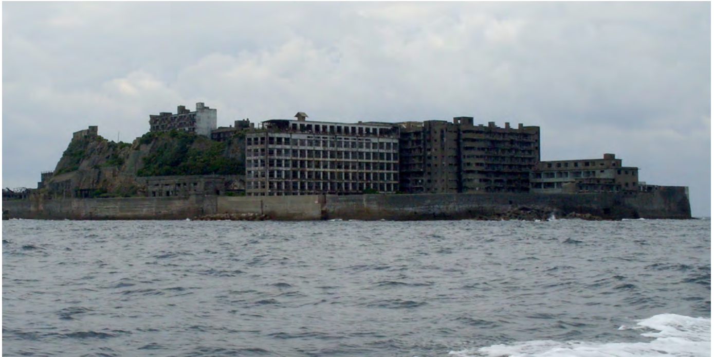
Hashima coal mining island (Gunkanjima), an undersea mine powered by electricity based on an artificial reclaimed island that became one of the world's most extraordinary mining communities.