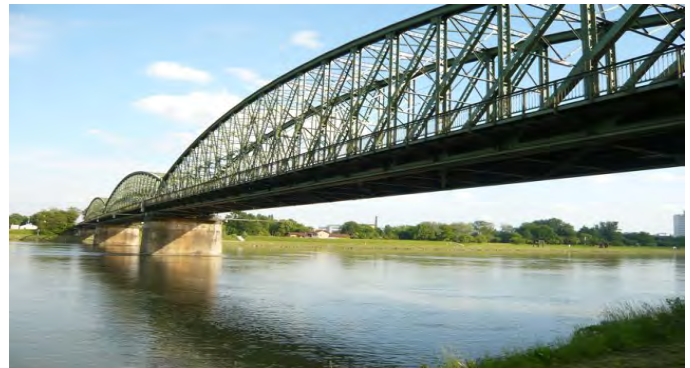
The railway bridge over the Danube river was considered a national monument