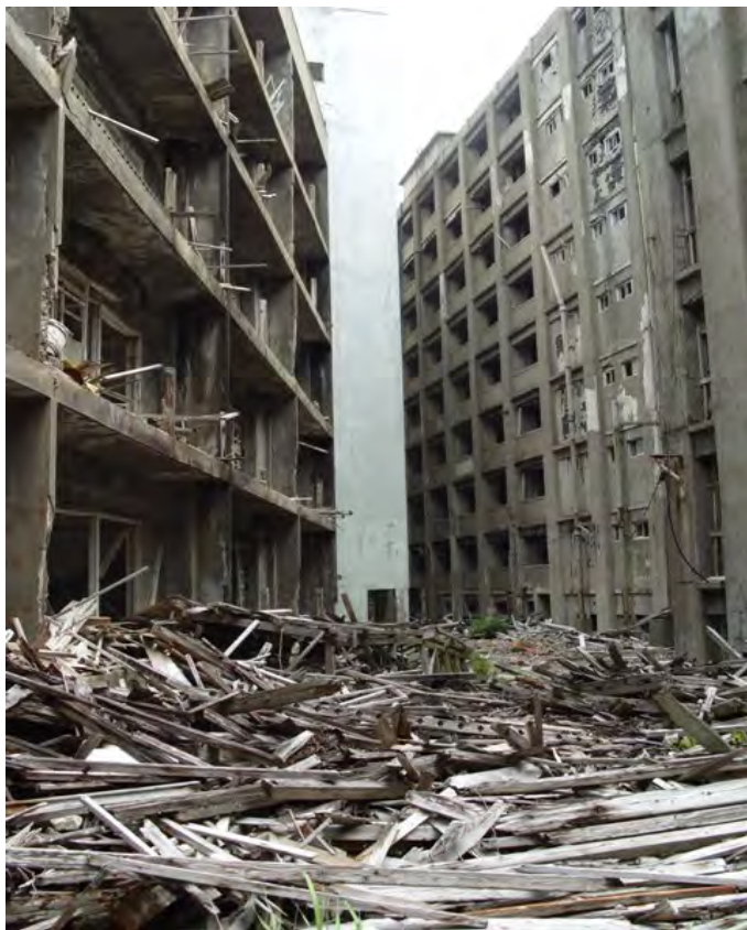
Hashima coal mining island building(Gunkanjima)