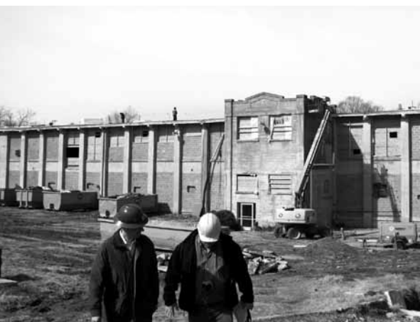
The renovation of the Durham Hosiery Mill #8 in Mebane for affordable housing is taking advantage of the state's new tax credit for mill renovation, enacted in 2006. The two-tiered tax credit rate is designed to especially promote the rejuvenation of historic industrial complexes in the state's smaller towns. The mill is interesting as an early example of reinforced concrete construction for industrial use.