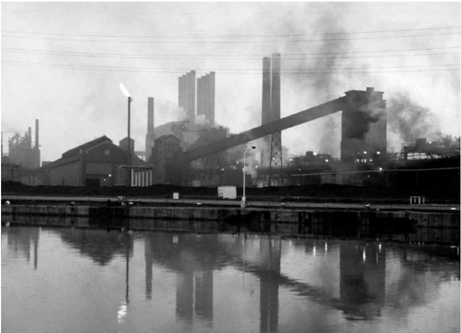
Preserving industrial sites for educational purposes involves more than just saving and presenting the buildings and structures. To fully understand the activities of these places, one should experience the heat and humidity, the noise, the smells. How much of this could visitors take? Shown here: Ford Motor Company River Rouge Steelworks, in Dearborn, Mich.

Many factories were built next to the rivers and streams that once supplied power, water for industrial processes and fire protection, and a place for waste disposal. These waterways are now scenic amenities. Almost all mills are, or were, surrounded by housing within reasonable walking distance and most have at least vestiges of retail space in the immediate neighborhood.