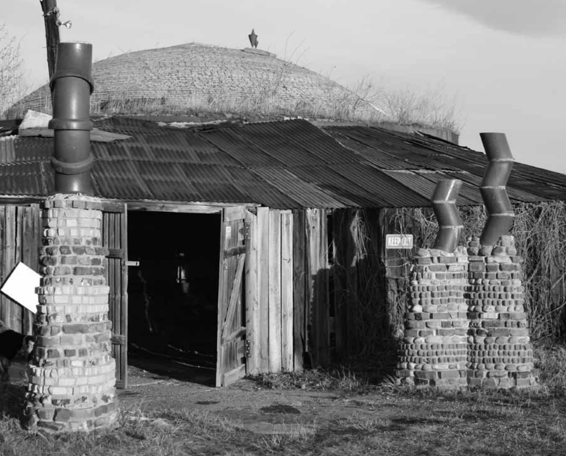
At the Archie Bray Foundation, artistic sculptural expressiveness combines with industrial heritage on the grounds of the former Western Clay Company brickyard. By preserving the company's early kilns (such as the beehive kiln shown here), the foundation highlights the continuity of the site's use.