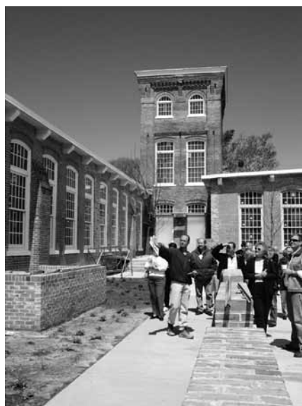
The Edenton Cotton Mill was rehabilitated using the state's tax credits, which were in many cases passed along to buyers of the condominiums in the mill. The renovation of the mill and homes in the adjacent mill village added more than $20 million to the local tax base.