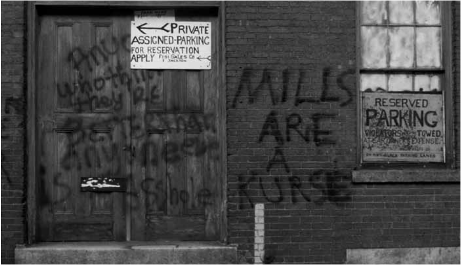
Closed mills in Lawrence, Mass., remain as bitter reminders of the collapse of its once-thriving textile industry. This negative view was expressed on the wall of a warehouse that was formerly a boardinghouse for female workers at the Washington Mills.