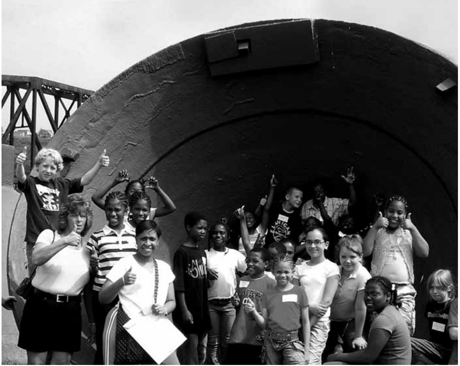
To draw attention to Pittsburgh's industrial heritage, the Steel Industry Heritage Corporation encouraged schools to take students on field trips to the mill sites and to develop curricula teaching local history. Here students from Rankin School enjoy a field trip to the Carrie Furnaces.