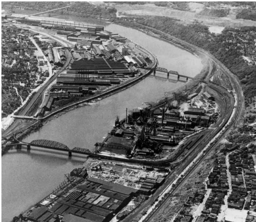
A 1951 photo of the Homestead Works, including the Carrie Furnaces, shows the extent of the site, stretching along both sides of the Monongahela River. As such steel mills closed down in the 1970s and '80s, tens of thousands lost their jobs.