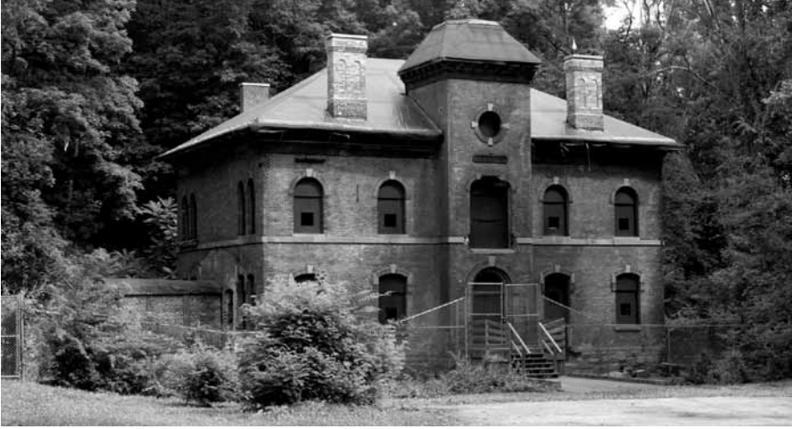
Michigan Tech students get hands-on experience documenting industrial sites in the US and abroad. The West Point Foundry in New York, a major producer of cannons in the 19th century (whose headquarters building is shown here), has been a subject of ongoing student research.