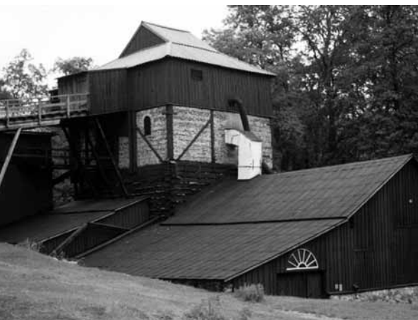
Engelsberg Ironworks, a World Heritage site in Sweden, preserves more than 50 buildings from a historic ironworking estate and associated farm. It is the most complete surviving example of a type of operation that was common in Sweden during the 17th through 19th centuries.