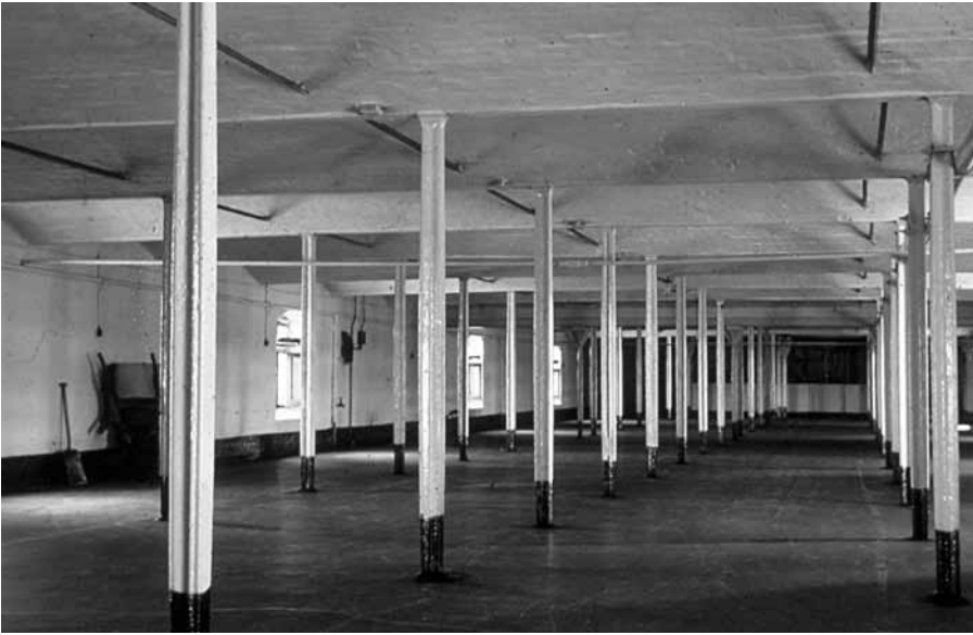
Ditherington Flax Mill in Shrewsbury, England (1796–97), which was the world's first iron-framed building, has stood empty for more than 30 years. Too precious to lose but too fragile to readily adapt, it is currently the subject of an English Heritage research and conservation initiative.