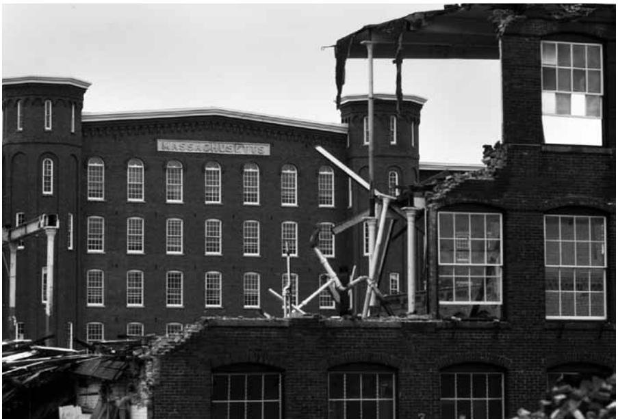
Massachusetts Mills, in Lowell, Mass., was demolished to open views to the Pawtucket Canal. The remainder of the complex was converted into apartments.

The commission also built an esplanade along the Merrimack River, past