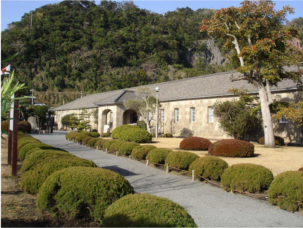
Fig. 2-1, 2-2

Silver furnace of Iwami Silver Mine, Iwami/Shimane Prefecture 2004