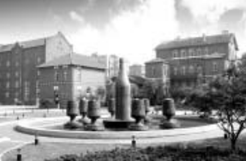
Qingdao Beer Factory (1903, Qingdao City, Shandong Province), the oldest working beer factory in China and one of three industrial heritage sites among the nine properties listed in the Sixth List (2006) of National Protected Monuments and Sites.