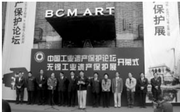
News conference at the presentation of the Wuxi Recommendation for industrial heritage in China.