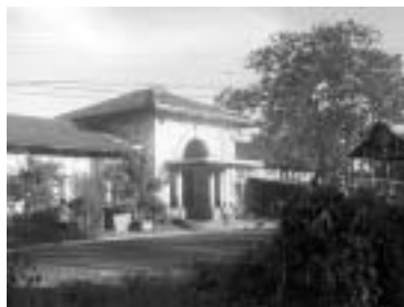
Tarlac railway station

stations and replaced with new ones. This wanton destruction will remove from history the vestiges of these stations leaving the people no trace of the rich architectural past the railways had on Philippine History. It is the purpose of this study to document and study the Spanish built stations along the North Line. To secure, document and if might be preserving the rich architecture these stations had for future generations of travelers to come.