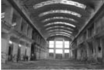
The Torroja factory near Madrid, an early reinforced concrete shell vault by the Spanish engineer Eduard Torroja on the Spanish threatened sites list.