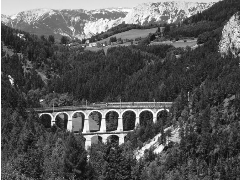
Kalte-Rinne-viaduct at the Semmering-railway.

which is the capital of the province Styria. On the next day the train pass the alpine landscape to bring the travellers the World Heritage region Hallstatt-Dachstein. There, a salt-mine will be visited which has a history of systematic mining of around 3000 years. Then the train ride leads to the Benedictine monastery of Admont; this monastery contains an extensive and impressive library. Back on the train, the route passes through the rough alpine valley named Gesäuse which is also a national park. The next World Heritage site is the valley of Wachau, a cultural landscape dominated by the Danube river and the wine-growing areas. Finally the tour leads back to Vienna where there are two World Heritage sites – the historic centre and the palace of Schönbrunn.