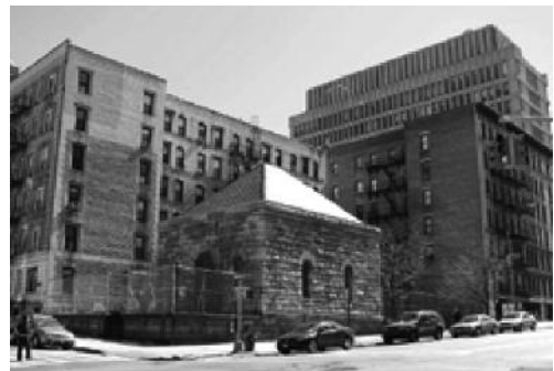
The 119th Street Gatehouse (center, corner of Amsterdam Avenue and 119th Street) was constructed in 1894-95 as part of the Croton Aqueduct system. The one-story rusticated granite building, which is an individually designated NYC landmark, has been vacant since 1990.

The challenges confronting waterworks heritage stewardship and sustainability continue to mount. At this moment, in the United States, monumental, visible, publicly-accessible and above-grade waterworks heritage is privileged in terms of recognition, designation, protection, political support and economic investment over the no-less monumental, but invisible, publicly-inaccessible, and below-grade heritage. There remains a need to expand the public's awareness of the engineering and cultural significance of this heritage. Encouraging a debate about the feasibility of preservation management guidelines that sensitively balance preservation and water management priorities for active waterworks heritage would be instructive. Best practices guidelines, such as the Nizhny Tagil Charter, as well as preservation management guidelines for historic bridges, might be carefully assessed for their feasibility and applicability to waterworks heritage. For decommissioned heritage, procedures need to be established which assist municipalities in surveying out-of-use structures and sites, and facilitating jurisdictional transfer of these structures and sites to new owners bound to preserve character-defining features. Ultimately, all of these ideas underscore one of the Nizhny Tagil Charter's maintenance and conservation goals: that "Continuing to adapt and use industrial buildings avoids wasting energy and contributes to sustainable development."