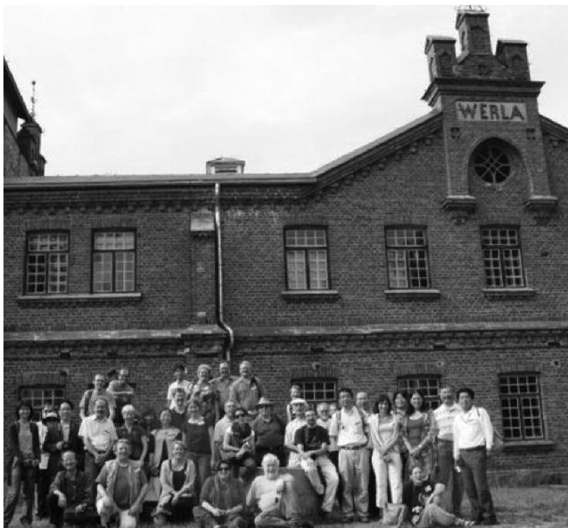
The post-conference visitors to the Verla board mill. The rest of the images and many more from Tampere are on the conference Facebook albums.

These particular structures merit their own international association, the IALA. It has recently updated its Lighthouse Conservation Manual which aims to help managers of historic navigation aids to conserve them and make them accessible to the public, a praiseworthy objective which the Manual goes a long way in promoting. Along with a tremendous amount of other information on lighthouses this can be downloaded from their webpage: www.iala-aism.org/