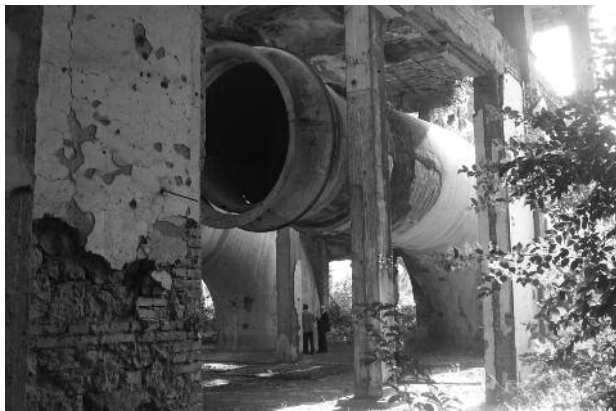
Actual view of the horizontal wind galleries.