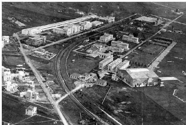
The airport and research centre, 1934.