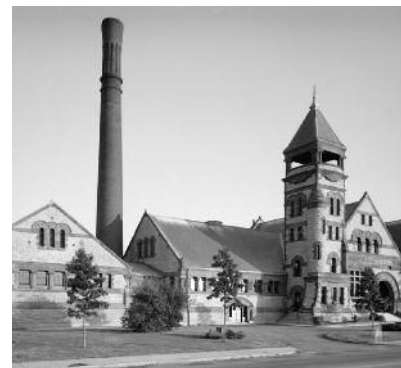
The Chestnut Hill Pumping Station, around 1983.