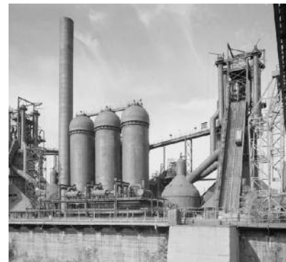
Number 6 and Number 7 Carrie Furnaces, around 1989.

pumping station was taken off line in 1976. The ornate Richardsonian Romanesque pumping house and its three steam pumps were listed on the U.S. National Register of Historic Places in 1990 and have recently been saved as part of the Metropolitan Water Works Museum. The new entity plans conservation efforts, exhibits, school tours, and events, with funding for the museum coming from a unique source: on-site residents. Sitting in a desirable location on the Chestnut Hill reservoir, Boston developers turned some of the site's historic buildings and some new construction into high-end condominiums. A portion of each sale and a portion of each monthly maintenance fee go directly to the museum board. The museum hopes to open to the public in March, 2011. www.waterworksmuseum.org