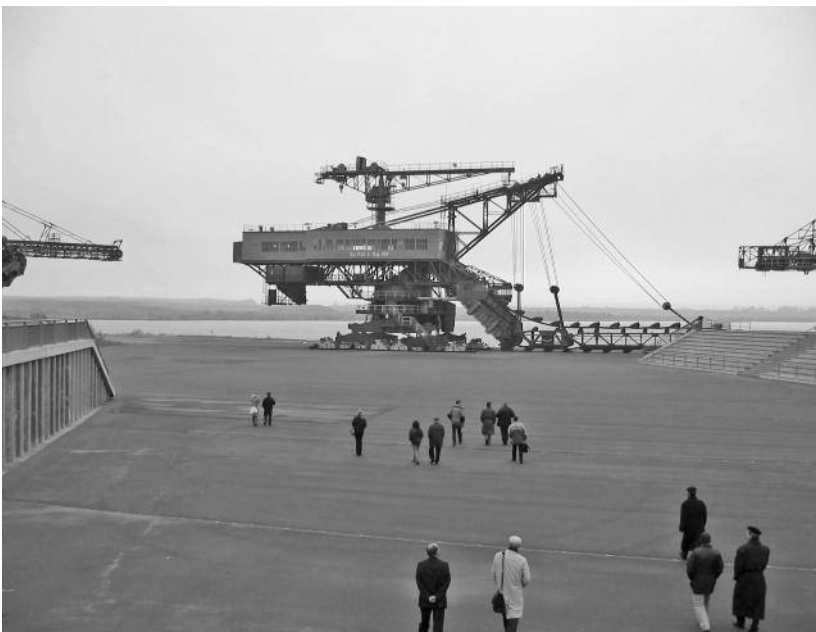
Gräfenhainichen. Event arena Ferropolis with decommissioned excavators as scenery.

The article is based on the author's presentation at the XIV TICCIH Congress and draws on the results of the development and research project "Rehabilitation and Development in Mining Regions" (READY), funded by the EU INTERREG III B programme from 2004 to 2007. Partners from six European countries (Austria, Czech Republic, Germany, Italy, Romania and Slovakia). Basic research in Bad Bleiberg was done by the Karl Franzens University (KFU) Graz, Institute of Geography and Regional Science.