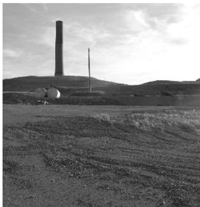
During the 1980s, all structures related to the smelter, except the stack, were demolished during remediation activities, most with little consideration for historic significance. While the stack itself is an imposing and impressive landscape feature, the barren hillside surrounding it belies the level of activity that existed at the site for nearly 80 years.

cleanup over a century of mining and smelting operations.)