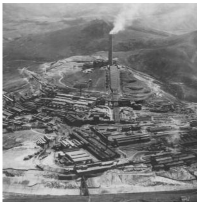
Anaconda Copper Company Washoe Smelter, Anaconda, Montana ca. 1950. For many decades this was the largest and most productive copper smelter in the world, employed thousands of workers, and was responsible for several innovative processes.

■ As we are all aware, industrial heritage faces threats and challenges every day. One often overlooked challenge is the destruction of historic industrial sites undertaken during the remediation of environmental contamination. It is difficult to argue against correcting the ill effects of decades or even centuries of industrial activity. It is not simply a moral question, but makes good economic sense to attempt to put contaminated, inactive landscapes back into some form of safe productive use. But these are the same arguments for heritage preservation. Often the very reasons that make historic industrial sites significant, such as extensive production,