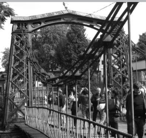
From the TICCIH post-conference tour of Saxony and Silesia: the suspension bridge of 1827 at the Mala Pane ironworks, Ozimek Poland.