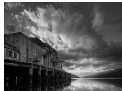
Long Loch station, Scotland

So torpedo testing facilities can be found all around world. Many of these testing stations are abandoned, and have already found new uses, as the Torpedo Art Factory in Alexandria near Washington in USA, or in China, on Quingai Lake in northwest in Quingai province. Many others are around world in almost all coastal states which had Navy with torpedoes. Almost all have impressive constructions, they are on nice sea or lakeshore locations, and all connected will intriguing historical technological stories. The possibility of new use for this torpedo facility is a common question as in any industrial heritage revalorisation.