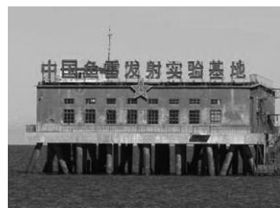
Lake Quinhai, China