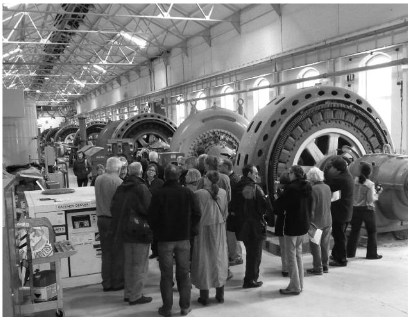
Tour of the DeCew Falls Generating Station near Ste. Catharines, Ontario. The oldest still operation generating plant in Ontario, it was established in 1898 and expanded in 1903 and 1911.

an open discussion with the conference participants, two commitments were made. The first was to retain the conference website ( www.industrialstrengthconference.ca ) and to rework it into a more general website which will provide the means to disseminate information and to create a central portal to other local and regional websites related to the field of industrial heritage. The second was to identify a location for a second national conference to be held in three years time. The website is currently the process of being redesigned and a tentative offer was made to host the second national conference in Nova Scotia in 2012. We all feel we are off to a good start.